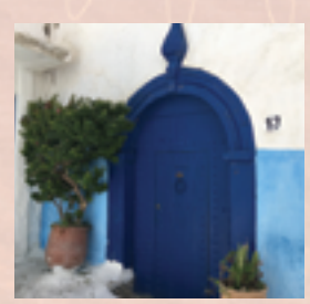
Door in Oudaya Kasbah

FITNESS LEVEL REQUIRED: This tour is on the adventurous side. Four days involve travel in four wheel drive vehicles, much of it in the Atlas Mountains up to 2900metres. Two nights we spend in basic accommodation belonging to the Ait Khozema project at Amassine in the Atlas Mountains. The rest of the nights are spent in good quality hotels and riads. Some days involve extensive outdoor walking, steps and rocky ground. Toilet and washing facilities in some places will be rudimentary. The tour should not present any problem to active people who can manage day to day walking, squatting and stair climbing. If you have any doubts about your ability to manage the tour please contact us to discuss your situation.