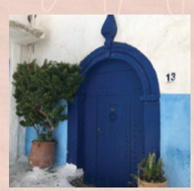
Door in Oudaya Kasbah

FITNESS LEVEL REQUIRED: This tour is on the adventurous side. Four days involve travel in four wheel drive vehicles, much of it in the Atlas Mountains up to 2900metres. Two nights we spend in basic accommodation belonging to the Ait Khozema project at Amassine in the Atlas Mountains. The rest of the nights are spent in good quality hotels and riads. Some days involve extensive outdoor walking, steps and rocky ground. Toilet and washing facilities in some places will be rudimentary. The tour should not present any problem to active people who can manage day to day walking, squatting and stair climbing. If you have any doubts about your ability to manage the tour please contact us to discuss your situation.